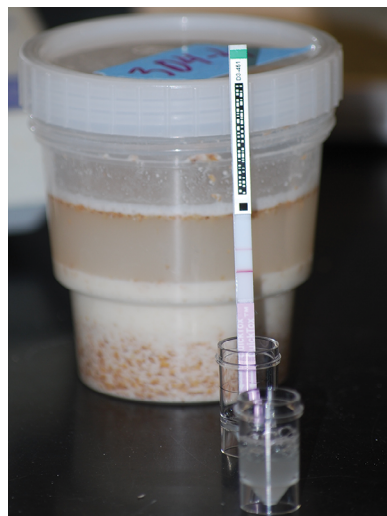
Figure 3. A corn sample being tested for mycotoxins using supplies from a test kit.

Several companies sell kits that detect and measure specific mycotoxins. Using such kits will require an initial investment of several thousand dollars to purchase the proper testing equipment. However, once you have the equipment, the cost of testing a single grain sample (a subsample of a larger sample) for one particular mycotoxin is usually less than $10 (Figure 3).