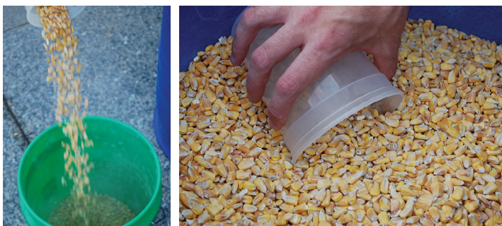
Figure 1. Several subsamples of corn are pooled to form a larger representative sample.

Although sampling methods vary, the size of the representative sample is consistent. According to the USDA Grain Inspection Handbook , a representative sample is at least 4.4 pounds, and preferably 5 pounds (2-2.5 kg). In many cases, several subsamples will be taken and then combined into a single composite sample (Figure 1).