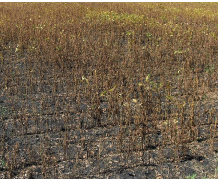
Figure 1. Severe charcoal rot in a soybean field.

favorable for disease development — such as warmer summer and winter temperatures and reduced rainfall — have likely contributed to its presence. Yield loss from charcoal rot is highly variable, but farmers can reduce crop injury by implementing best management practices based on a better understanding of this disease.