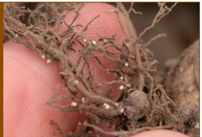
Figure 13. Plants infected with soybean cyst nematode can be distinguished by white cysts on the roots.

White SCN females are most readily observed on soybean roots starting about six weeks after crop emergence.