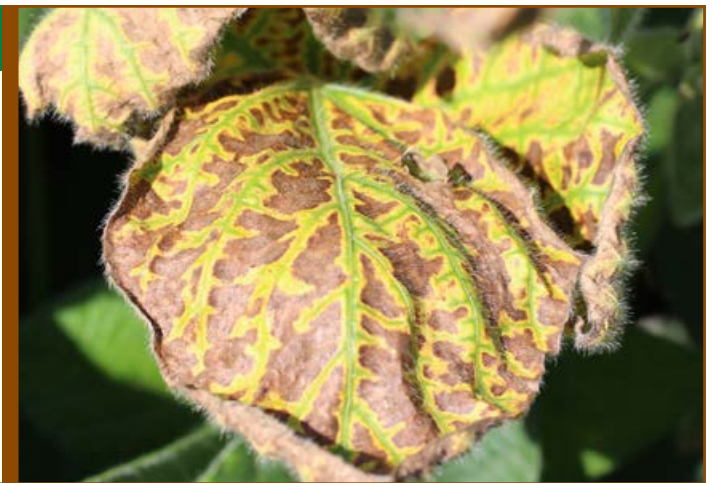
Figure 14. Sudden death syndrome symptoms occur between the veins.

Symptoms of SDS occur between the veins rather than causing generally brown, crinkled leaves.