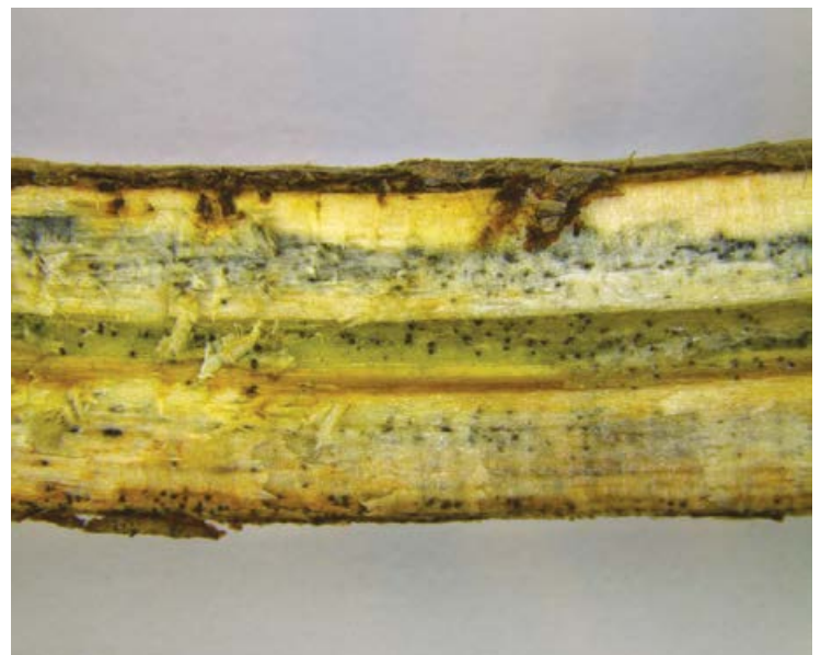
Figure 2. Macrophomina phaseolina colonizing a soybean stem.