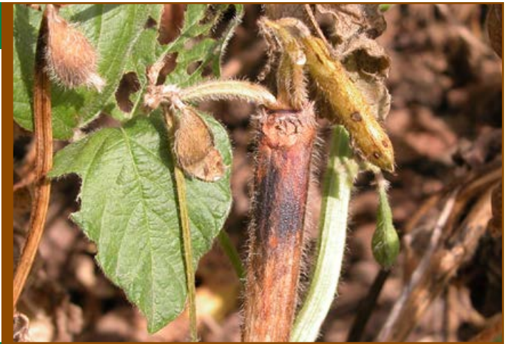
Figure 14. Stem canker produces brown to black, slightly sunken lesions.

Stem canker is distinguished by the production of brown to black, slightly sunken lesions or “cankers” that start at the nodes and grow completely around the stem. These will typically not be at the soil line extending upward like Phytophthora root and stem rot.