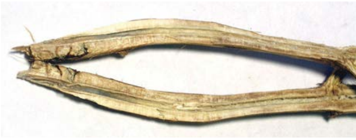
Figure 8. Internal soybean stem discoloration due to charcoal rot.

Charcoal rot is hard to diagnose in dry years, since it is difficult to distinguish between the symptoms of the disease and those of general drought stress. However, plants with charcoal rot die more quickly during periods of drought stress than those without the disease. To accurately identify charcoal rot, pull symptomatic plants and split the lower stems and taproot to confirm discoloration as light gray or silver (Figure 6) and the presence of black streaks (Figure 8) and microsclerotia (Figure 7).