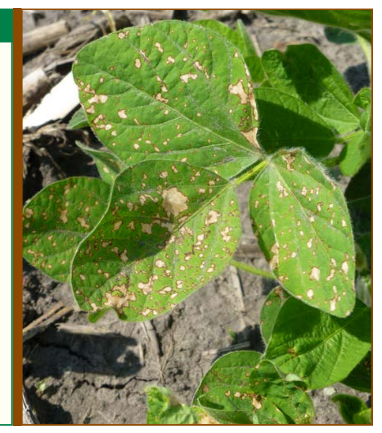
Figure 12. PPO herbicide injury is confined to the area of the plant where herbicides were applied.

PPO herbicide injury will appear on lower leaves (older growth in the canopy). Frogeye leaf spot lesions typically appear in the upper soybean canopy (newer growth). Frogeye leaf spot will begin in small pockets in the field whereas herbicide injury will occur over the entire field with many "spots" appearing at once.