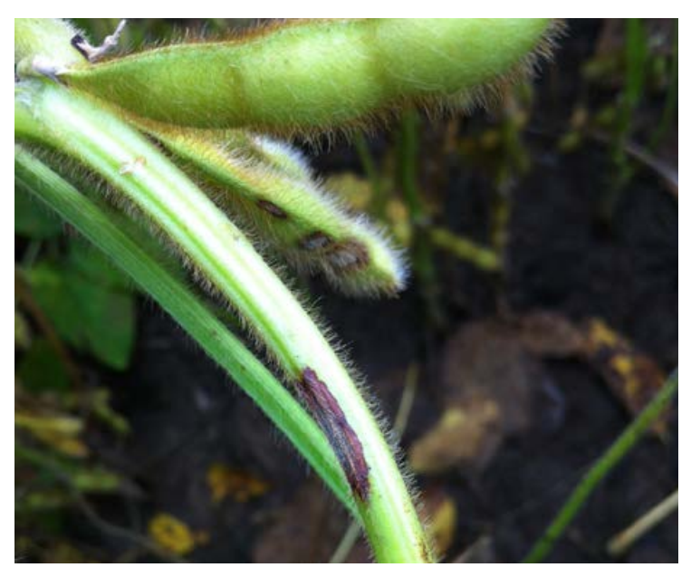
Figure 5. The fungus that causes frogeye leaf spot can cause discolored, elongated stem lesions.

In addition to leaf lesions, frogeye leaf spot symptoms can occur on stems and pods late in the season, but these symptoms can be difficult to identify. Stem lesions appear elongated (Figure 5). Pod lesions appear oblong and resemble foliar symptoms (Figure 6). Severely diseased pods can infect and discolor seeds. The fungus that causes frogeye leaf spot may infect seeds, which results in light purple to gray discoloration, but infected seed also may not show any symptoms.