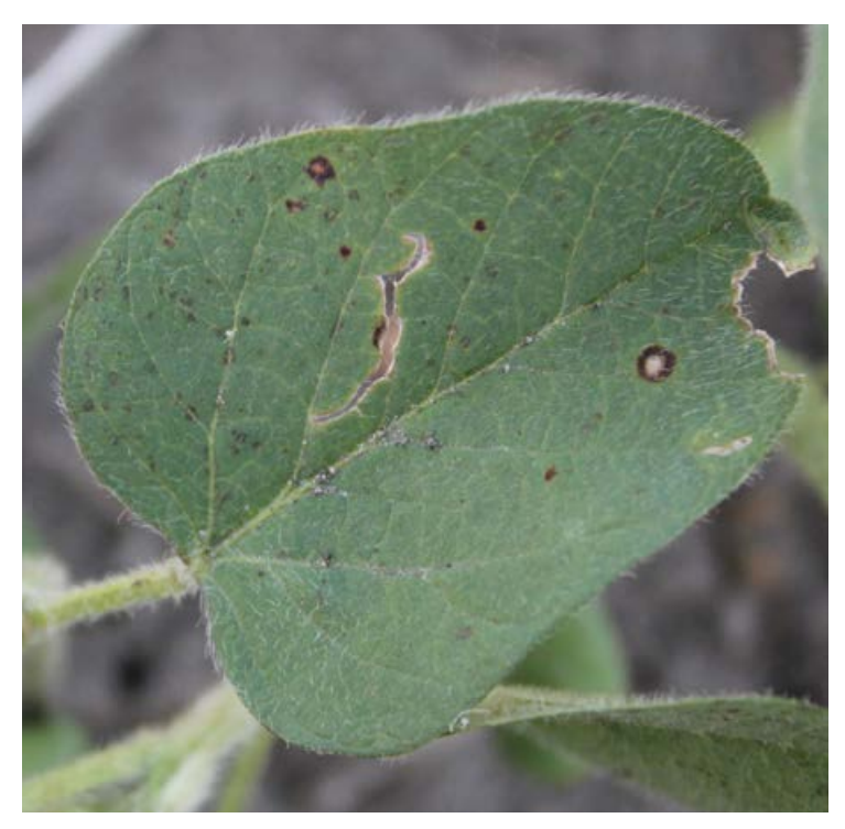
Figure 7. A frogeye leaf spot lesion on a unifoliate leaf early in the growing season.

There are reports of the fungus being transmitted by seed, although this has rarely been observed in the field. Wind and splashing water may disperse spores. Spores produced on infected plants can move to new plants in the same field, and wind can also disperse the spores to nearby fields.