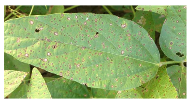
Figure 1. Frogeye leaf spot symptoms start as small dark lesions.

Frogeye leaf spot initially appears on upper leaf surfaces as small, dark, water-soaked spots (lesions) (Figure 1). Eventually, these lesions enlarge and become round to angular.