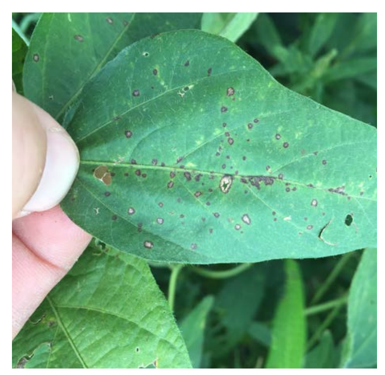
Figure 9. New leaves are more susceptible to infection by the fungus that causes frogeye leaf spot than older leaves.