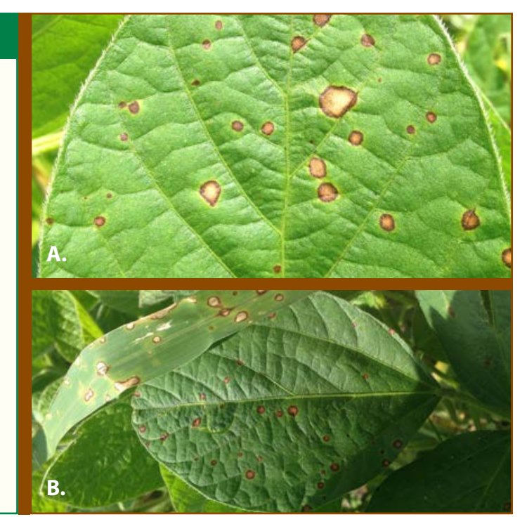
Figure 13. Paraquat herbicide injury (A) appears similar to frogeye leaf spot. However, paraquat injury symptoms will be found on all plant species in the affected area (B), not just soybean.

How to distinguish paraquat injury from frogeye leaf spot: Paraquat injury will affect other plant species (including weeds exposed to the drift), not just soybean. Herbicide injury typically will follow a regular pattern that corresponds with the herbicide application. Check application records to determine if herbicide injury could be the cause of the disorder.