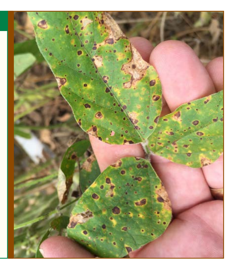
Figure 11. Secondary target spot lesions can appear similar to frogeye leaf spot.

How to distinguish target spot from frogeye leaf spot: In soybean varieties susceptible to target spot, secondary target spot lesions can form in the upper canopy, but rarely have the purple margin around the lesion that is commonly observed with frogeye leaf spot.