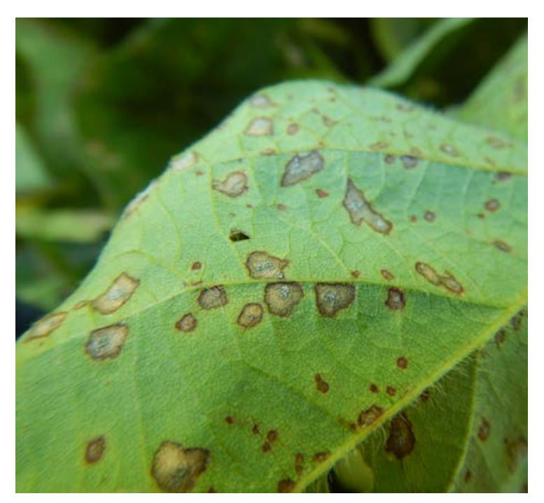
Figure 4. Fuzzy gray sporulation (conidia) of the frogeye leaf spot fungus can sometimes occur in lesions on the undersides of leaves.

When environmental conditions are favorable, fungal sporulation occurs, which gives the underside of lesions a gray and fuzzy appearance (Figure 4). Lesions can coalesce to create blighted areas on leaves. When frogeye leaf spot is severe, plants can prematurely defoliate.