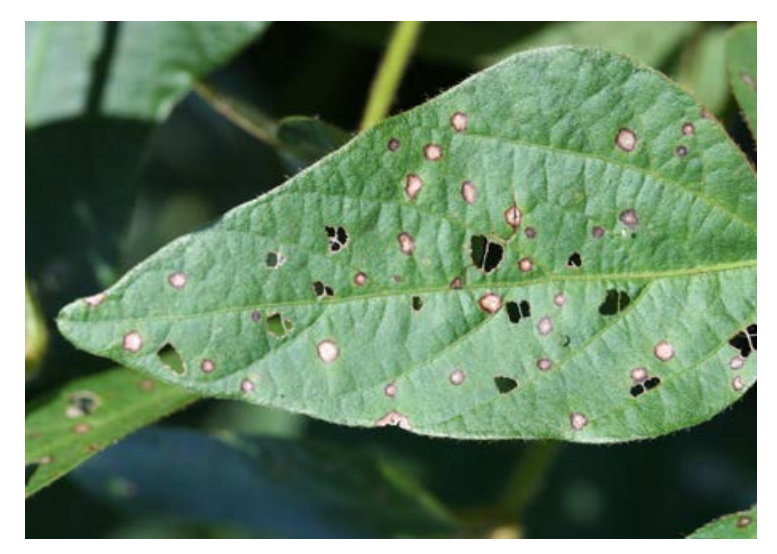
Figure 2. Reddish purple margins surround the gray centers on mature frogeye leaf spot lesions. The missing areas on this leaf are from insect feeding.

The centers of frogeye leaf spot lesions progress from gray to brown to light tan, and are surrounded by a narrow reddish purple margin (Figure 2). On some soybean varieties, you may also see a light green halo around the lesion border (Figure 3).