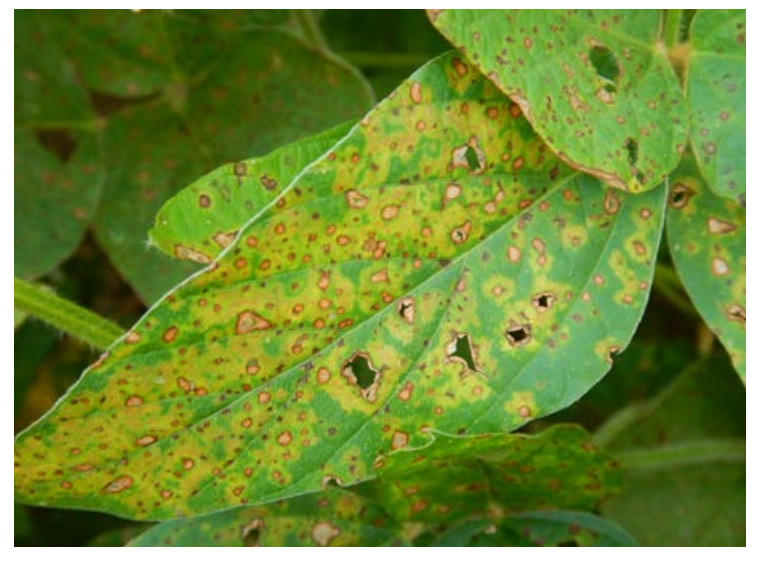
Figure 3. On some soybean varieties, frogeye leaf spot lesions may have light green to yellow halos.

When environmental conditions are favorable, fungal sporulation occurs, which gives the underside of lesions a gray and fuzzy appearance (Figure 4). Lesions can coalesce to create blighted areas on leaves. When frogeye leaf spot is severe, plants can prematurely defoliate.