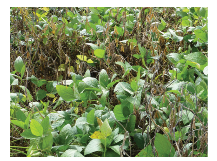
Figure 3. White mold can dramatically reduce soybean yield when severe. For every 10 percent increase in DIX after 65 percent, there was a corresponding yield loss of 10 bushels per acre.

In these studies, pesticide application timing significantly affected disease reduction and yield benefits. Two applications during flowering provided the most control and greatest yield benefits (Table 5). Single applications at beginning flower (RI) and full flower (R2) resulted in higher disease control than applications at beginning pod. Applications outside these flowering periods provided the lowest white mold control and yield benefits.