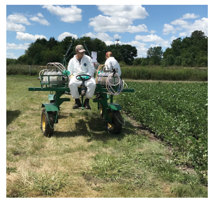
Figure 2. This study used more than 2,000 research plot-level data points across the North Central United States. One application method was using spray rigs capable of applying multiple treatments to research plots.