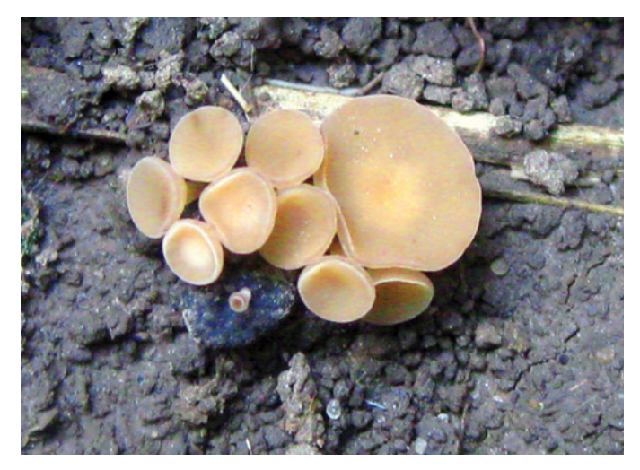
Figure 4. Apothecia germinate from sclerotia and release spores that infect soybean flowers, which makes certain chemical applications during soybean flowering the most effective treatments.

This analysis does not incorporate the benefits of resistance management and rotating modes of action across fields and seasons. All treatments generate positive benefits when disease severity and crop value are sufficiently high. For that reason, they can be part of an economical resistance management program.