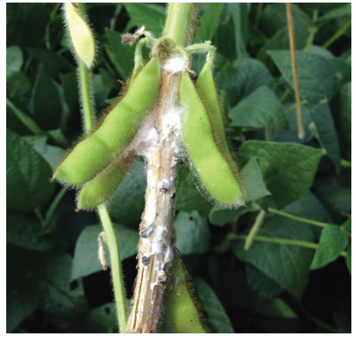
Figure 1. Characteristic white mold symptoms and signs include white, fluffy fungal growth on stems; hard, black sclerotia embedded in infected plant tissue; and bleached stems.